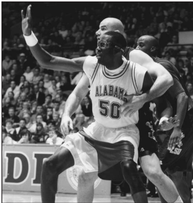
Roy Rogers set an SEC single-game record with 14 blocks vs. Georgia in 1996. Rogers finished the season with 156 blocks, one shy of Shaquille O'Neal's record in 1992.