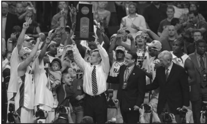
In 2007, Florida captured its second straight national championship and the SEC's 10th.

1946—Kentucky 1976—Kentucky 1990—Vanderbilt 2005—South Carolina 2006—South Carolina