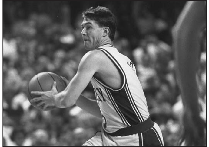
In 1994, Kentucky's Travis Ford recorded the highest free throw percentage in the SEC since 1980. Ford, the 1994 SEC Tournament MVP, also posted league bests in three point shooting in 1993 and in assists in 1994.