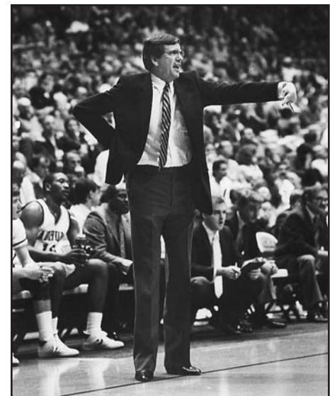
Auburn led the SEC in rebounding an unprecedented five-straight seasons during Sonny Smith's tenure.